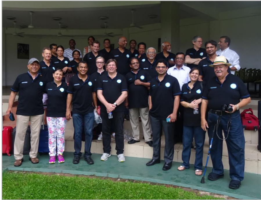
BEAP team on way to Batticaloa